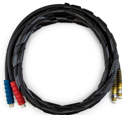
455144DSETW - No prefix keeps the 12ft hoses black. The suffix "DSETW" adds SureGrips, makes it a pair of hoses instead of one, and adds spiral wrap.