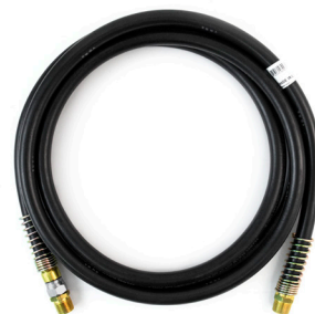
455144 - Base part number only. 12ft black hose with no handles, just 1/2" fittings

Need a custom length, a non-standard component, or something else? Just give Customer Service a call and we can build your unique hose in no time!