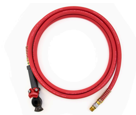
R455144ANRMAXX - The prefix "R" changes the 12ft base hose to red and the suffix "ANRMAXX" adds a red MAXXGrip