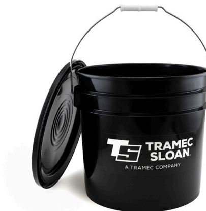
3.5 gallon Tramec Sloan branded buckets TSMK01 are available individually