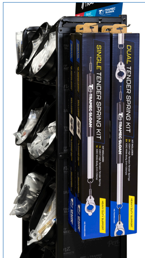
All product kits come with the FS225HTX31 Single Tender Kit and FS2252HTX31 Dual Tender Kit