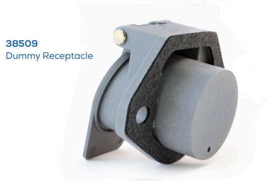
38509 Dummy Receptacle