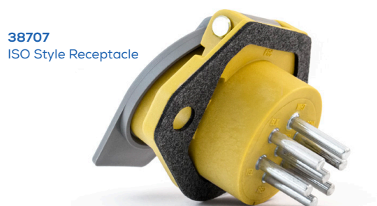
38707 ISO Style Receptacle