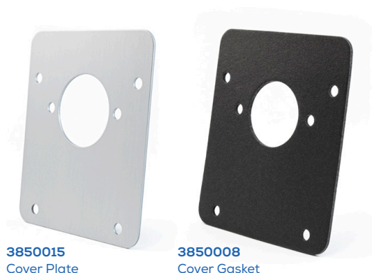
3850015 Cover Plate