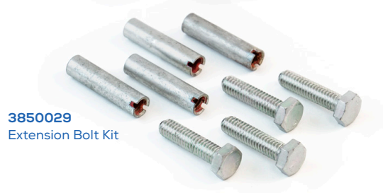
3850029 Extension Bolt Kit

* Deep Receptacles are 16% deeper than standard to allow max depth function for J560 plug and a more secure connection