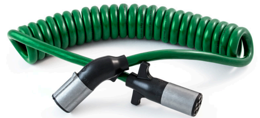
4A115: Coiled ABS Cable with XT Jacket, One Angled Plug, Zinc Sleeves, 15' with Two 12" Leads

HEAVY DUTY XT JACKET: Provides Superior Cut, Tear & Abrasion Resistance. Plus, Excellent Coil Retention & Flexibility in Both Cold & Warm Weather Extremes.