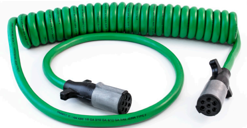
4D017: Coiled ABS Cable with Standard Jacket, Two Straight Plugs, Zinc Sleeves, 15' with One 48" Lead