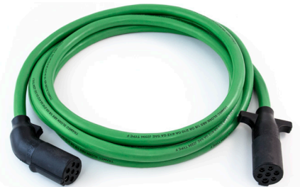
4CD12: Straight ABS Cable with Standard Jacket, One Angled Plug, Nylon Sleeves, 12' Length