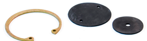
Service Kit #451715