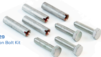
3850029 Extension Bolt Kit

* Deep Receptacles are 16% deeper than standard to allow max depth function for J560 plug and a more secure connection