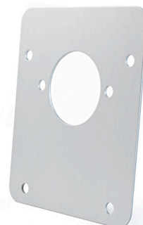
3850015 Cover Plate