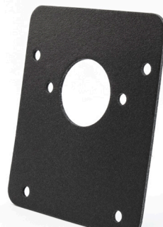
3850008 Cover Gasket