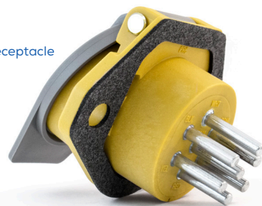
38707 ISO Style Receptacle