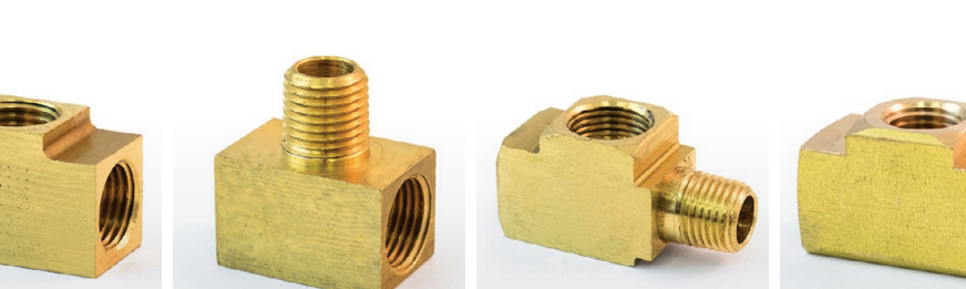
S245IF S244IF S251IF Union Tee Male Branch Tee Male Run Tee Female Branch Tee