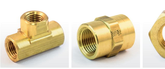
S207 Female Pipe Coupling Pipe Lock Nut